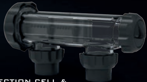
MULTI-DIRECTION CELL & HOUSING INCLUDED