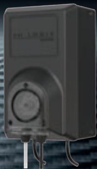
SMART INTERFACE TO CAS PH-LOGIX *SOLD SEPERATELY

** - all readings taken at 230Vac and in optimum salt water ppm, with a water temperature of 26°C.